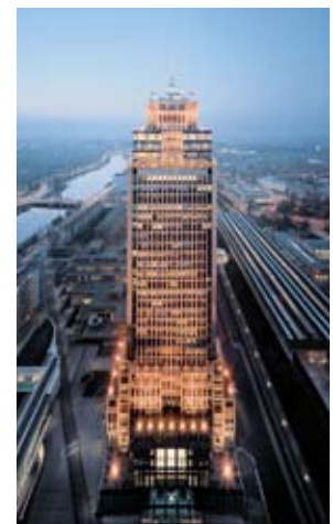
Rembrandt Tower, Amsterdam, Uninstitutional European Real Estate

Institutional customers are also increasingly combining their various property investments in pooling vehicles. We have developed solution concepts in response to this need.