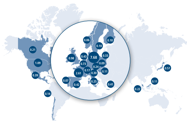
Real estate assets by country (in € bn)