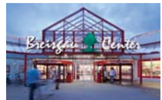
Breisgau-Center, Freiburg, UII Shopping Nr. 1