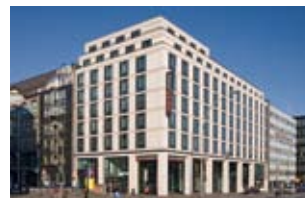
InterCityHotel, Hamburg, DEFO-Immobilienfonds 1

The institutional real estate funds DEFO-Immobilienfonds 1 (35 years old next year) and DIFA-Fonds Nr. 3 are tailored to the objectives of a small group of investors.