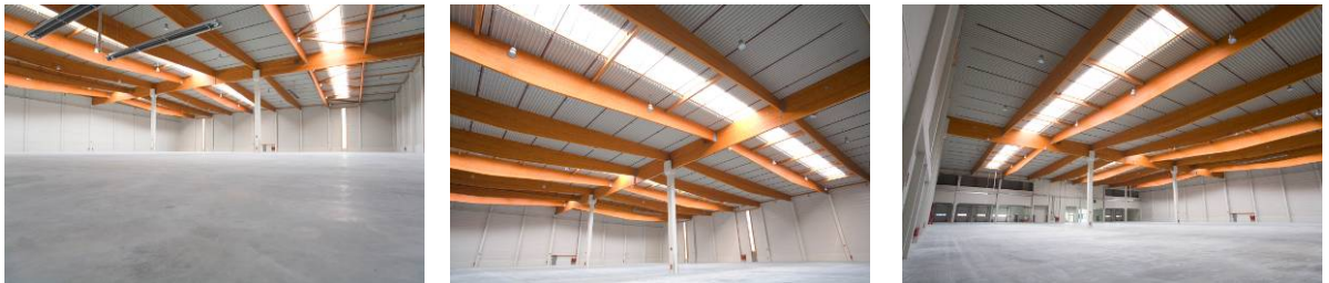
Caption: The smart roof design with its wooden beams is an attractive feature