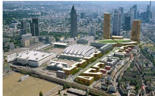
Building mass model of the Boulevard with architectural detail (confirmed projects only)