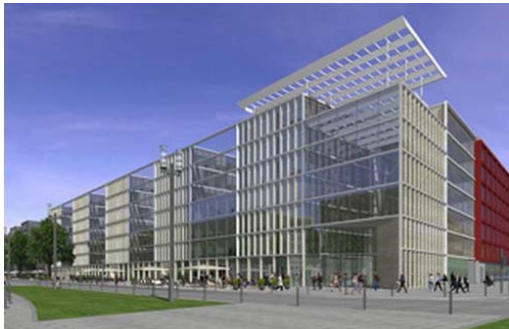
Visualisation of the building on the Boulevard (plot “Nord 1”)