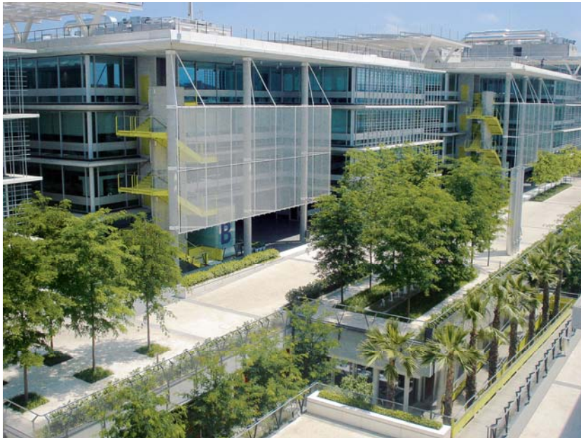
Palmas Altas Technological Center in Seville