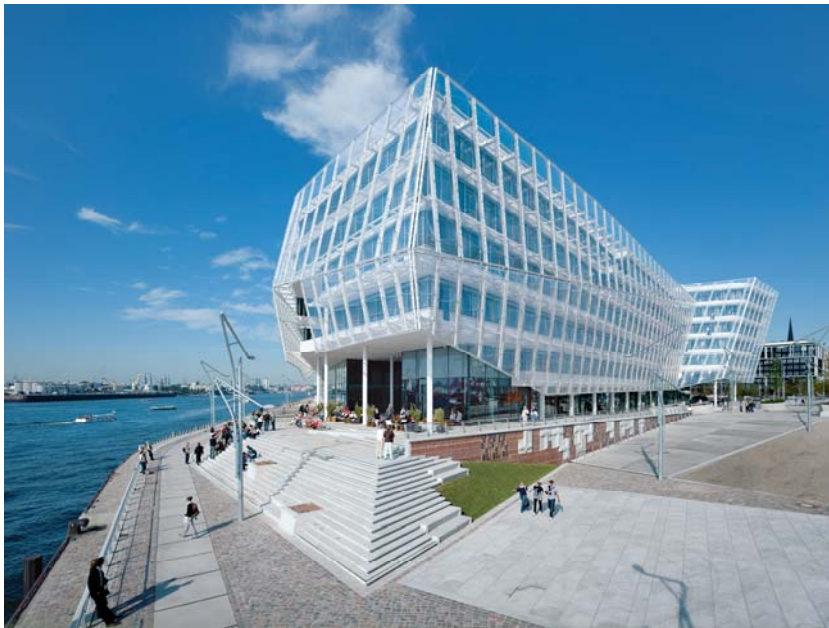
Unilever House in Hamburg