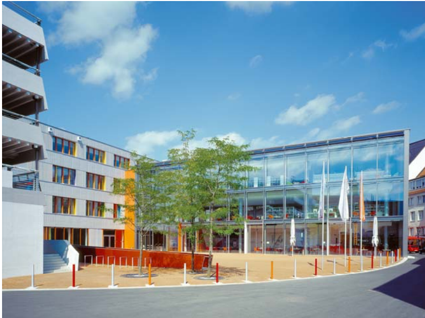
New city library in Augsburg