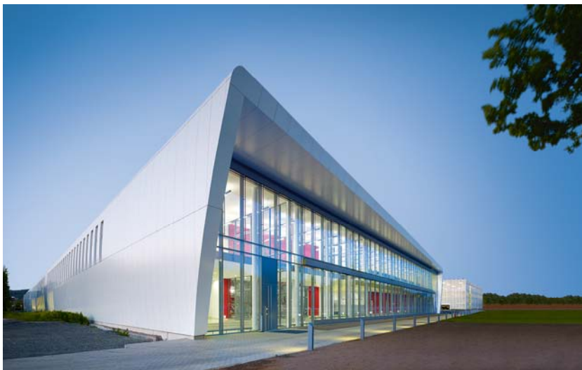
Production hall in Niesetal

The 30 best-ranked entries submitted for the 2010 Prime Property Award 2010 will be featured in book form. Details of